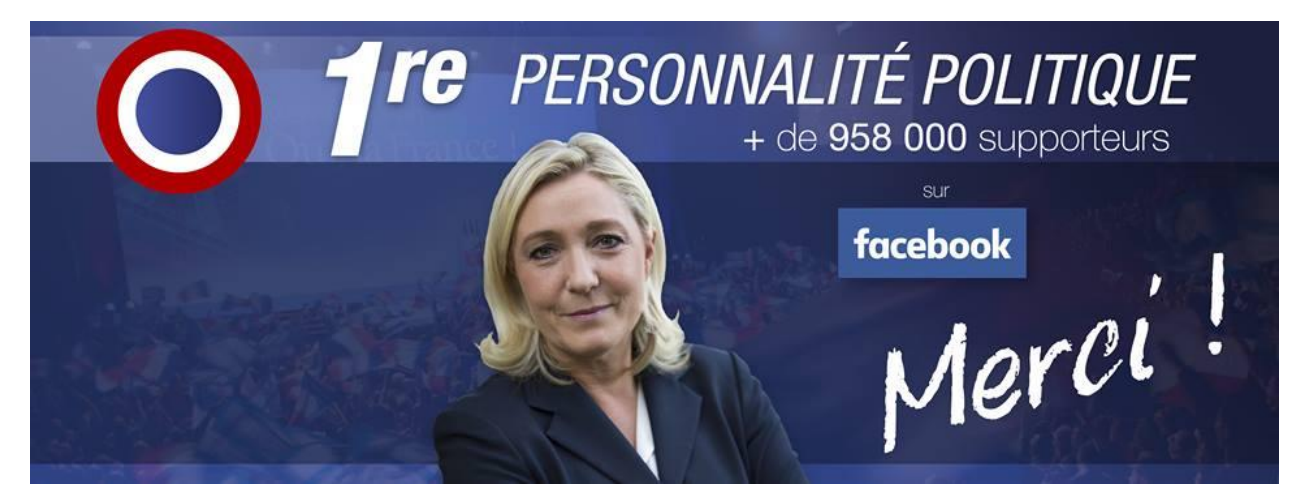
As of March 15, 2016 Marine Le Pen is the most "liked" French political figure on Facebook, surpassing Nicolas Sarkozy of Les Républicains.<sup>143</sup>

This result has been projected by the French Institute of Public Opinion.<sup>142</sup> France's presidential voting system is such that if no candidate garners an absolute majority of votes in the first round, the two candidates with the greatest number of votes move on to a second and final round of voting. Jean-Marie Le Pen in 2002 is thus far the only National Front candidate to have made it into the second round of the presidential election.