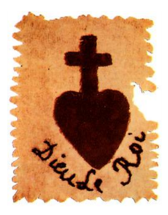
"God the King" - A patch worn by Vendean insurrectionists.<sup>73</sup>

Republic were apt to make the same error. Having honed in strictly upon the royalist element of the Vendean uprising, the First Republic erred greatly in their characterization of the rebellion. Fearing for the future of the Republic, and the possibility of a re-established monarchy, the Republicans were brutal in dealing with the Vendeans, and on March 19 issued a decree ordering all who wore its symbol, the white cockade, to be executed within 24 hours.<sup>74</sup> Another decree issued on August 1 set forth a new strategy for Republican troops in the Vendée: to completely and utterly destroy it. Troops were commanded to burn down all of the trees and houses, kill all of the livestock, and otherwise make the region uninhabitable by any great number of people. By February 1794, this strategy proved itself to be very successful. Pockets of insurgency were destroyed successively, leaders and followers alike were captured and killed, and by May 1795, what had once been a successful and semi-organized rebellion had effectively been stopped, and